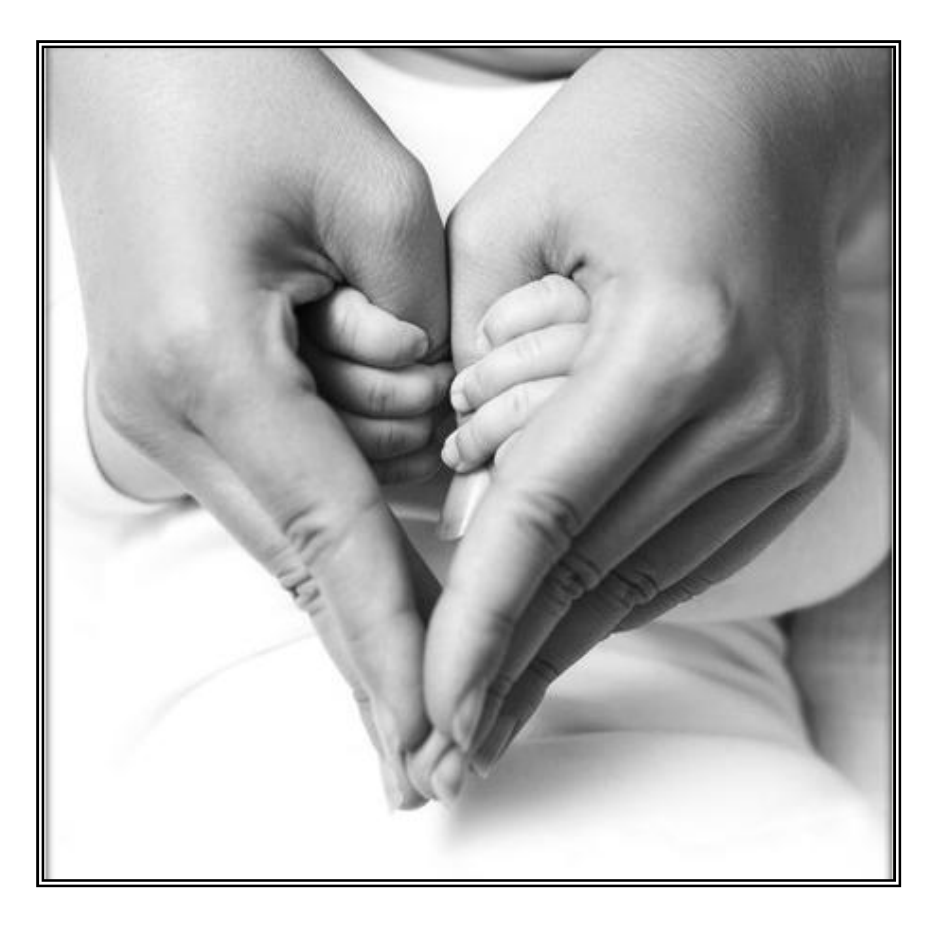
"Let your father and mother be glad; let her who bore you rejoice." Proverbs 23:25 (ESV)