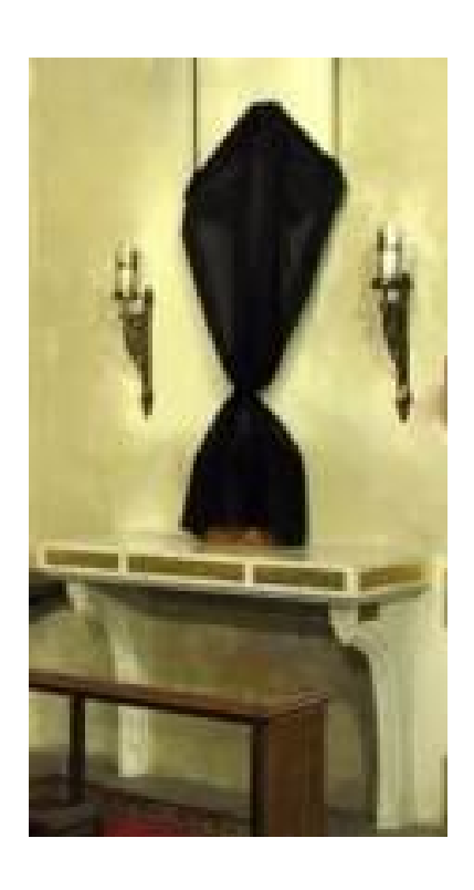
The Veiling of the Church

The special season of Lent finds many churches using special linens to cover various elements in the church. Some churches veil pictures, statues, crosses, crucifixes, and other objects during Lent as a special custom which serves as a visual reminder of the solemnity and penitential mood of the season.