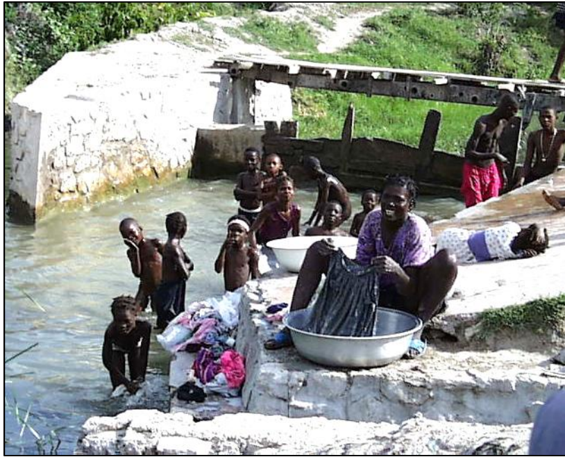
Public bathing, laundry and gathering of drinking water area near Gonaives, Haiti.